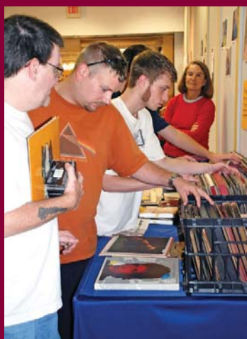
Shoppers browse the collectors section at last year's sale.

Cleaning out your closets or attic? Donate your old vinyl records, DVDs, CDs, cassette or VHS tapes and gently used stereo equipment to the SIRIS Classic Vinyl & Media Sale to benefit WSIU Radio's Southern Illinois Radio Information Service (SIRIS) .