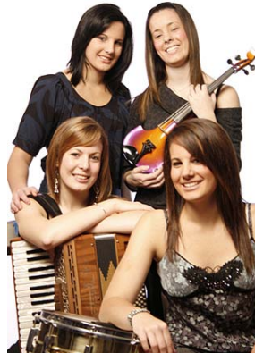
Give Way.

More festival details will be available by mid-April in the program guide posted online at silirishfest.org . We look forward to seeing you soon!